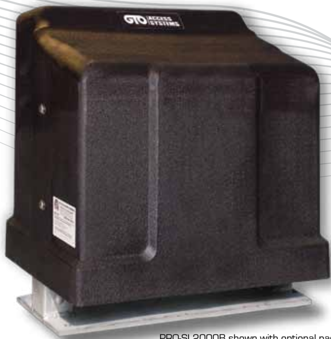
PRO-SL2000B shown with optional pad mounting plate (SGMP).

Technology • Innovation • Quality Since 1987